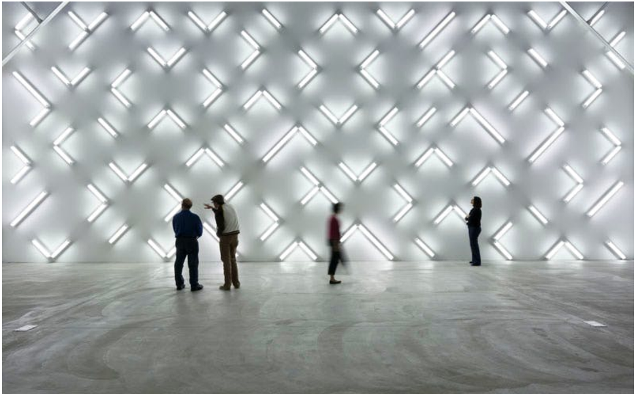
Light and Space (2007), Robert Irwin (b. 1928), 115 fluorescent lights, 6.9×15.7m (wall). Installation view at Museum of Contemporary Art, San Diego. © Robert Irwin/Artists Rights Society (ARS), New York.

A quintessential Light and Space story surrounds an installation Irwin made in 1970, a commission for a new shopping mall out in Northridge, in the middle of the San Fernando Valley. (For coastal Angelenos like Irwin, native to the south-west part of the city, The Valley – as it is always called – is widely considered off the map, beyond the pale geographically, socially and culturally.) At the time, Irwin had been experimenting with casting clear acrylic to make freestanding vertical columns, designed to be nearly invisible from certain angles and then startlingly prismatic as you moved about them. The works were not meant as obelisks in the manner, say, of John McCracken's resin planks, but as interventions that would radically alter the viewer's perception of a given space.