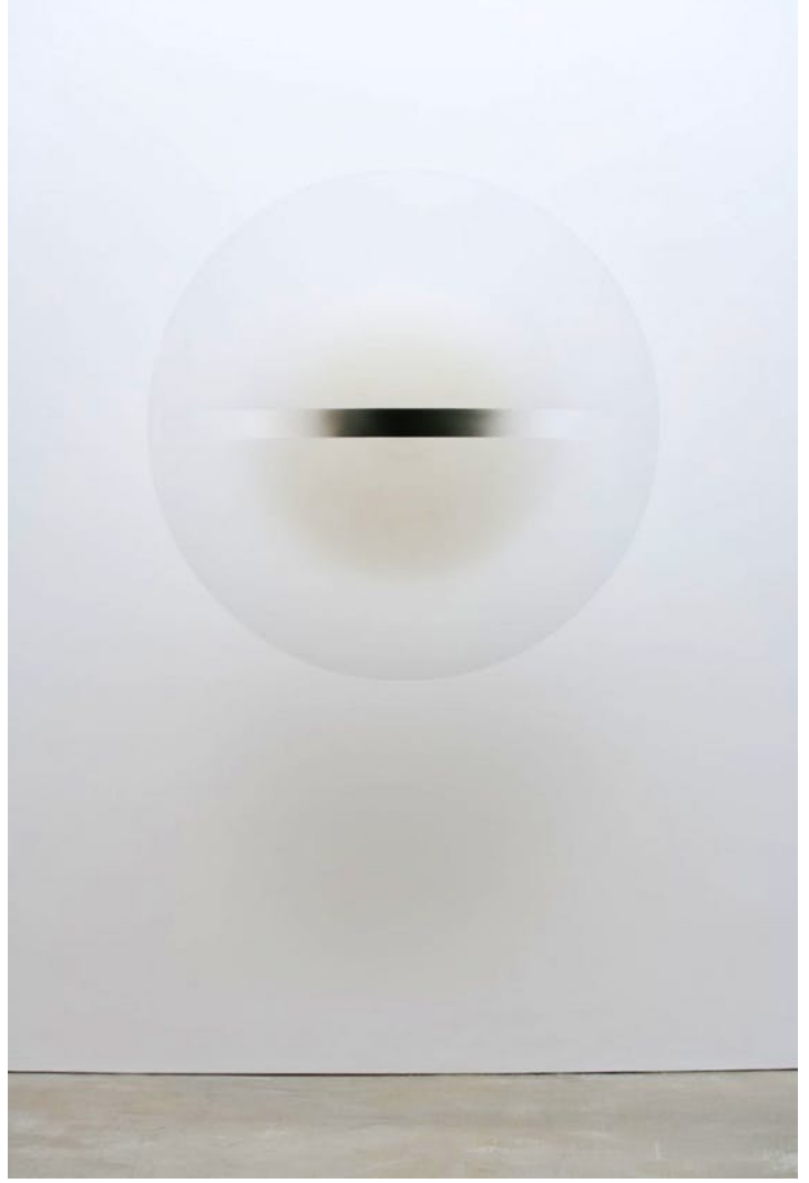
Untitled (1969), Robert Irwin, acrylic paint on cast acrylic, diam. 134.7cm. © Robert Irwin/Artists Rights Society (ARS), New York.

Irwin was not satisfied with his Expressionist efforts, however, and in the early 1960s his painting made an abrupt turn, becoming radically reductive: two or three horizontal lines, for instance, on a coloured ground, which he would rework fastidiously until the painting began to hum at the intense, high-pitched visual frequency that he was after. In 1966, after experimenting with convex canvases, he dispensed with traditional painting techniques altogether, making polished discs of aluminium and, later, plastic that hovered away from the wall and, in carefully modulated lighting conditions, seemed to lose their edges altogether.