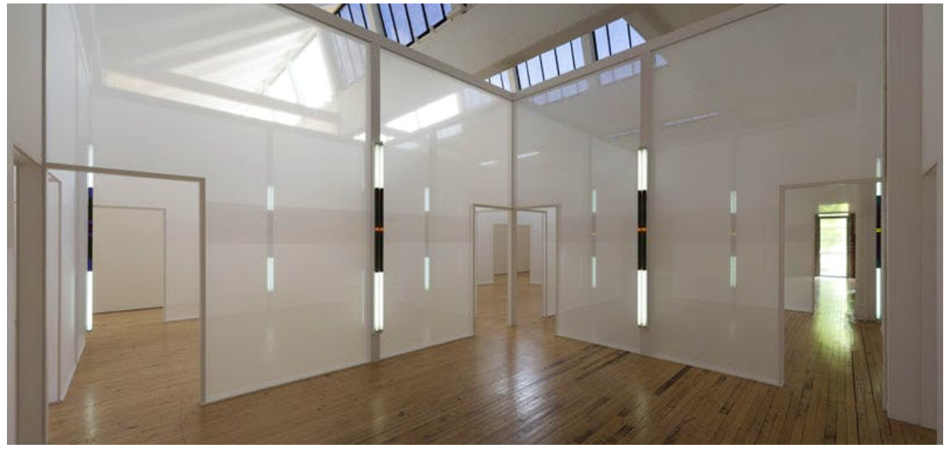
Excursus: Homage to the Square³ (2015), Robert Irwin, Tergal voile, fluorescent bulbs, and framing materials. Installation view at Dia:Beacon; Riggio Galleries, New York. © Robert Irwin/Artists Rights Society (ARS), New York.