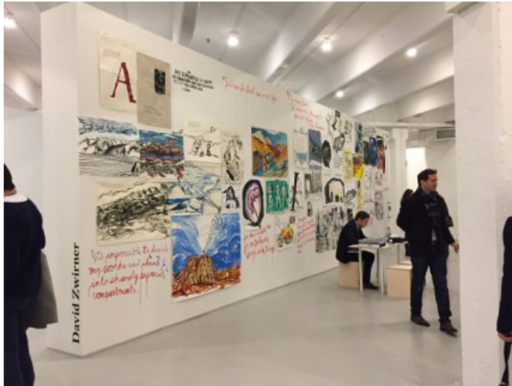
Two walls of Raymond Pettibon at David Zwirner.

“To be something different, it has to engage with culture. This [Independent Projects] is really about the artists,” he responded. “And you have to be willing to walk away. If it doesn’t work, we won’t do it again—but we hope it works.”