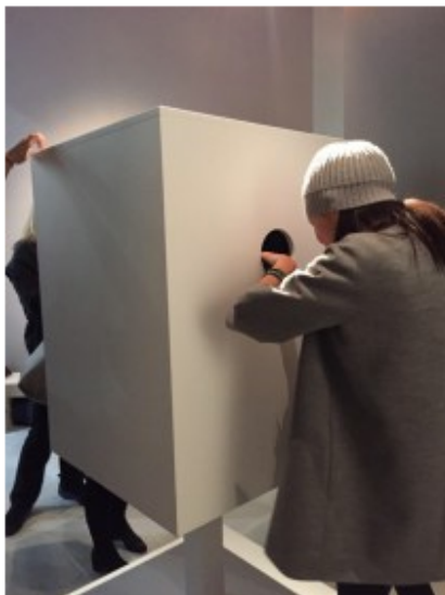
Yves Klein's Sculpture tactile at Dominique Lévy.