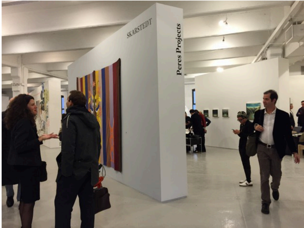
Independent Projects opened to press and collectors on November 5, 2014.