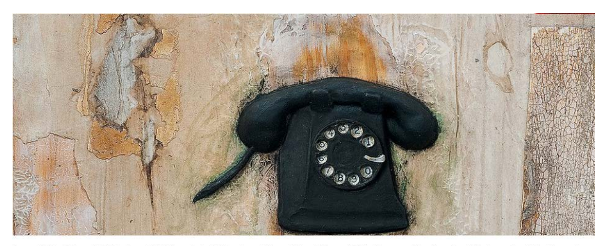
Telephone (detail), undated | Courtesy of the artist and Kayne Griffin Corcoran, Los Angeles