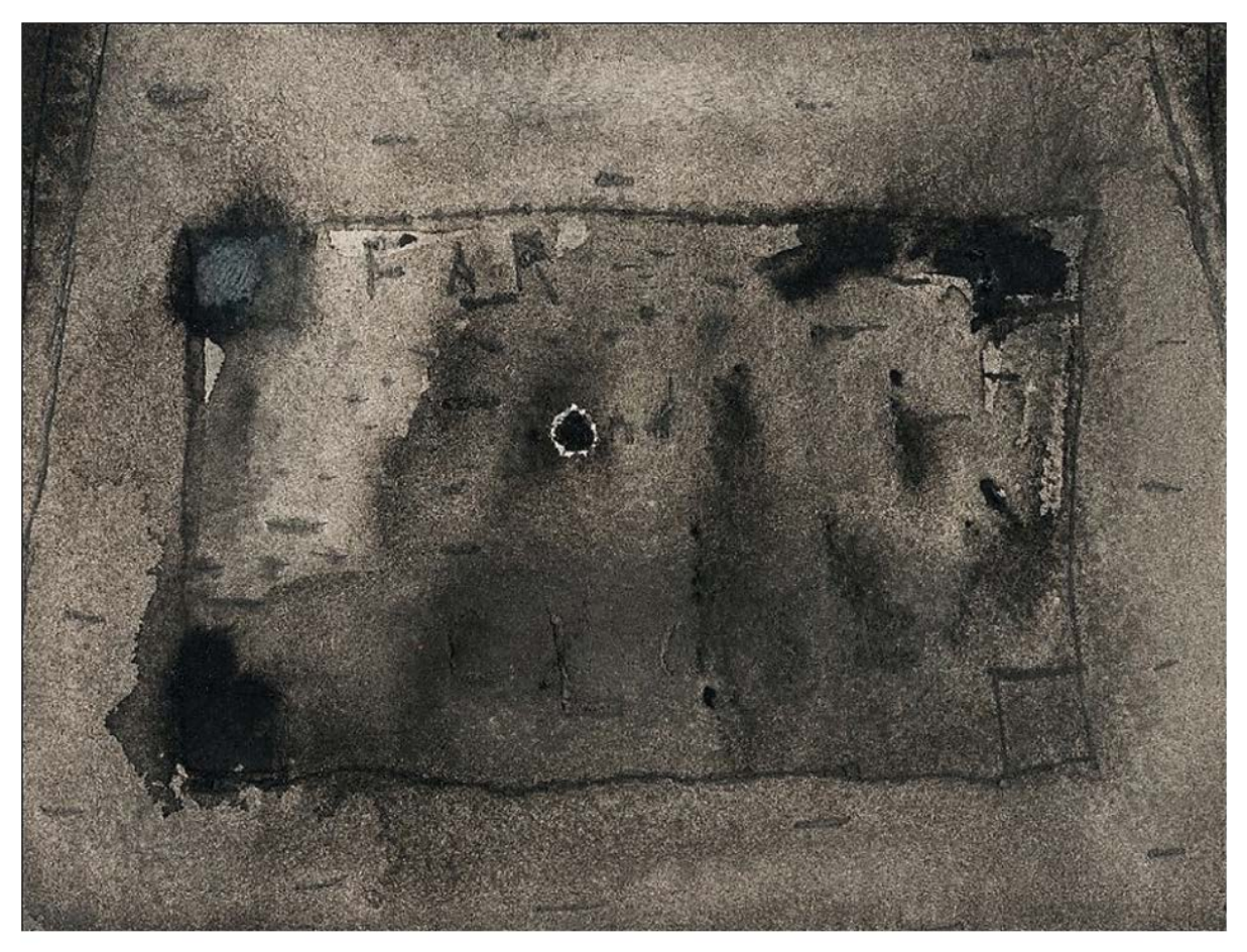
Image © David Lynch, Far Close, undated | Courtesy of the artist and Kayne Griffin Corcoran, Los Angeles

The words scrawled into the surfaces are the central theme of the exhibition: 'naming'. It attempts to explore the relationship between words and things: a relationship which is never as simple as it seems.