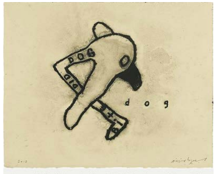
Image © David Lynch, Dog, 2012 | Courtesy of the artist and Kayne Griffin Corcoran, Los Angeles. Photography: Brian Forrest

Dog (2012) shows a Surrealist influence: it is a single shape which is made up of a composite of different forms: these could be crossed limbs, an animal head, and what looks like a hockey stick with the legend 'dog did bite' running up its side.